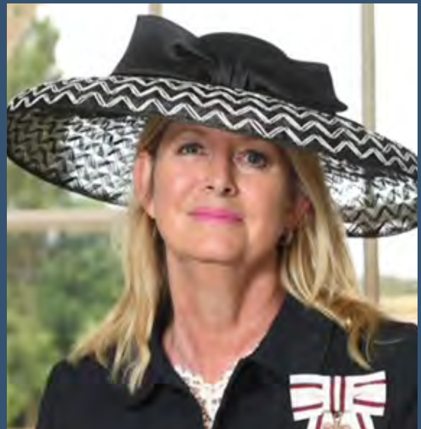
Susan Lousada HM Lord Lieutenant of Bedfordshire